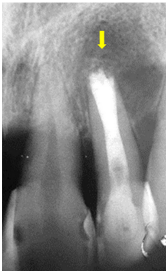
Figure 3 Radiography of preservation 6 months after tooth treatment 2.2.