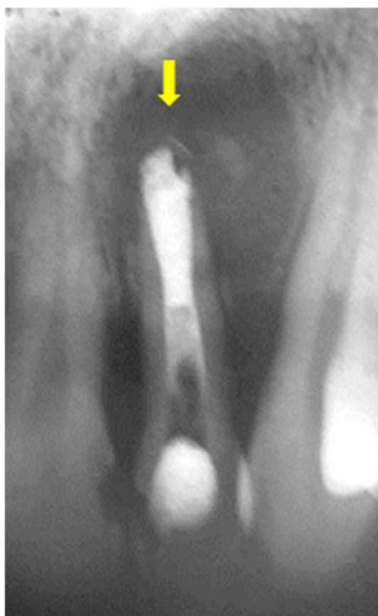
Figure 1 Initial radiograph of tooth 2.2 showing periapical lesion and incomplete rhizogenesis.